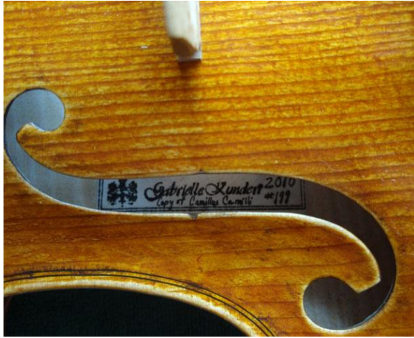
Figure 26. Detail of Camillus Camilli copy (2010)

of the process. It may have a place in the beginning student instruments.” 60 Kundert-Clements was convinced that she could make a traditionally-shaped instrument that was not only smaller in size but better in sound.