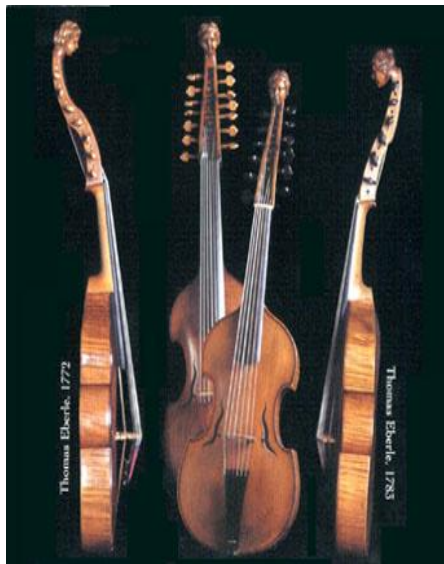
Figure 5. Original viola d’amore 31 Unusual shape of f - holes, rounded upper shoulders, long neck, human head for the