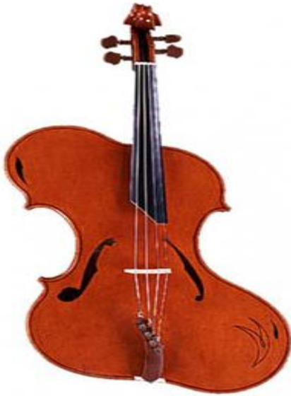
Figure 18. Pellegrina model viola with extra holes in the left upper bout and in the right lower bout