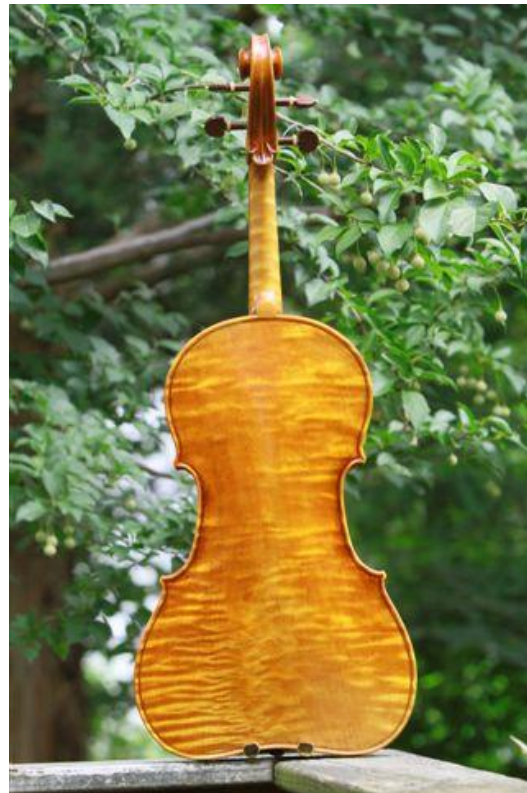
Figure 15. Back view