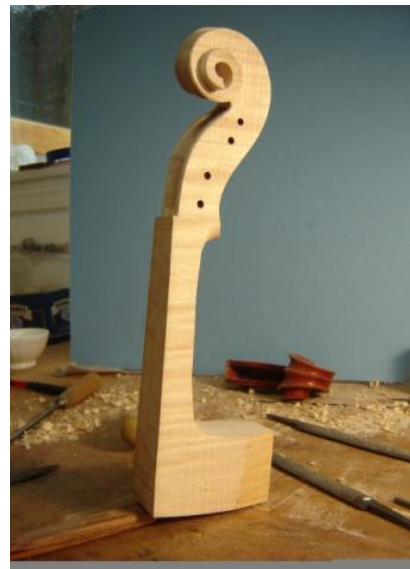
Figure 21. Scroll with no varnish (permission by Rivinus)