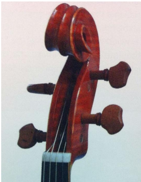
Figure 20. Scroll with uneven shape and hole (permission by Rivinus)

of the fingerboard curved so that it matched the upper and lower curved bouts. These changes required less supination on the G and C strings. Rivinus' goal was to make a thinner neck so violists can more comfortably play double stops and the left hand does not have to work as hard. He made another innovation in the bridge to enhance the sound. Rivinus cut out the extra wood on the bridge, because 25% of the wood on the bridge is non-structural and dampens the sound. With these results his viola produces a clearer and more direct sound rather than a very dark kind of nasal and guttural sound. 41 A comparison of a typical Stradivari model viola and the Pellegrina shows big differences in body length as well as the upper and lower bouts. Pellegrina has a 20-inch body length, while the Stradivari model has a 16-inch body. The upper bouts of the Pellegrina are 10 5/16 inches compared to 7 3/4 on a typical model viola, and the lower bouts of the Pellegrina are 12 3/16 inches compared to 9 5/8 inches on a typical viola. 42