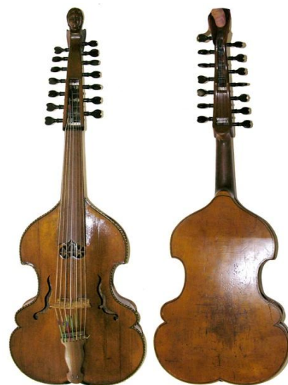
Figure 6. Viola d’amore - Paulus Alletsee, 1717, with a 19th century pegbox