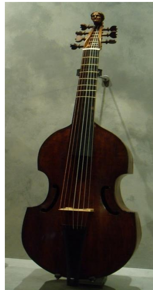
Figure 23. Viola da gamba (permission by Curtin)