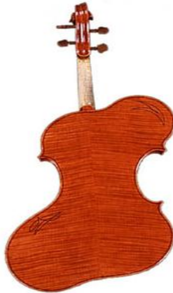
Figure 19. Back of Pellegrina (permission by Rivinus)

When building his instrument, Rivinus created two extra sound holes in the left upper bout and right corner of the lower bout to make the sound clearer (figure 18). He used lime wood with a veneer of phenolic resin for the fingerboards, reducing the instrument's weight by 10%. He likes lime because it is more environmentally friendly than ebony. Rivinus stated in 2004, "The first fingerboards were maple, often inlaid with purfling, ivory, or other elaborate design. And when ebony was introduced, it was used as veneer. Only much later were whole, solid pieces of this wood made into fingerboards." 40 One of Rivinus' customers, Joel Lipton, principal violist of the Netherlands Philharmonic Orchestra, shared his ideas with Rivinus. Lipton suffered from bursitis and was pleased by the improvement he felt when he used the Pellegrina. He suggested reshaping the tailpiece in order to fit the tuner to his preference and making the shape