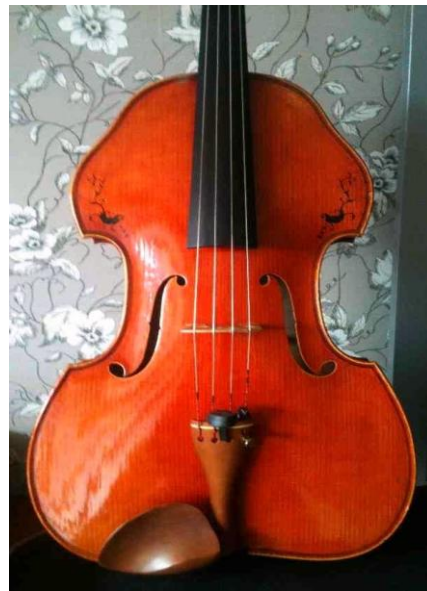
Figure 9. Adapted viola d'amore style (1982) (permission by Iizuka) Figure 10. Detail (author's image)