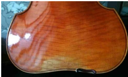
Figure 7. Indentation of the lower bouts.

Iizuka maintained the shape of the Baroque viola d'amore (figures 5 and 6), with its round and arched back, but altered the modern style of neck setting with humped shoulders: "This way, when a player goes into the fourth position, the left hand can 'hit' a reference point." However, cutaway or sloped shoulders diminish the air volume. To compensate for this loss, he "increased the lower bout size and width. Not having violin-style corners makes this change of form possible." Iizuka put an indentation at the bottom of the viola to shorten the body length. (figure 7.)