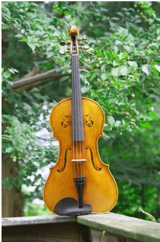
Figure 14. "Rubenesque" viola (permission by Iizuka) With normal upper bouts and indent in the lower bout.

His design for the scroll was based on the shape of the logo on a St. Louis Rams' football helmet he saw while he was watching a football game. In 1997, he carved a hole in the center of the scroll not only to reduce weight but also to give the appearance of a ram's head. Even this slight change made players more comfortable and made the sound clearer. In 1993, Iizuka branched slightly away from his viola d'amore-style model to design a "Rubenesque" viola (figures 14 and 15) with an indented bottom, shorter corner lengths, and slightly wider lower bouts. To further increase playability he made very slight asymmetrical adjustments to the right shoulder and left lower bout.