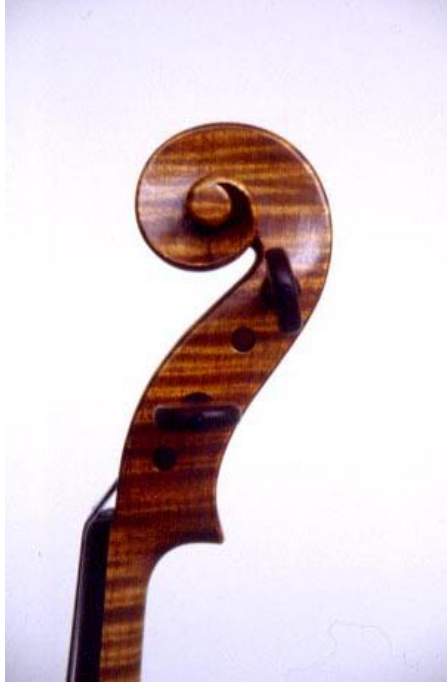
Figure 24. Single-turn scroll (permission by Curtin)