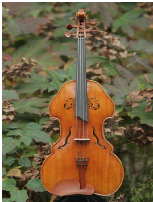
Figure 8. Iizuka's first viola (1979) in viola d'amore style With uneven fingerboard, the f - holes design similar to original viola d'amore, double cutaway style, and indented bottom.

His idea to add this to his design was shown in his successful debut in 1979 (figure 8). Even with the success of his d'amore style viola, he still looked for a better sound.