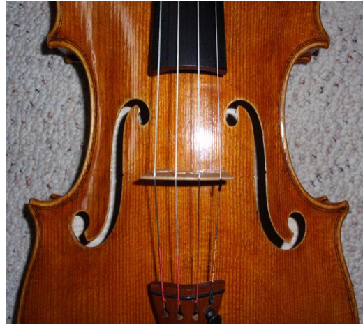
Figure 27. Copy of 16 1/8-inch Camillus Camilli viola (2010)