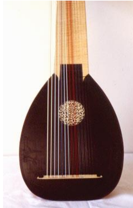
Figure 25. Wooden lute with a graphite top by Charles Besnainou.