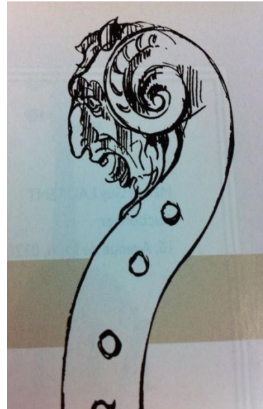
Figure 3. Devil's head drawn by Erdesz

Erdesz first began to achieve fame in Israel. He offered a cut-away model to Israeli violist Rivka Golani (b. 1946), and she eventually became Erdesz's second wife. Initially, Golani was doubtful about the new design but tried it because of her mother's strong suggestion. After playing the new instrument, she was convinced it was a good design. When she played the viola with the Boston Symphony Orchestra, its sound filled the hall. The Israel Philharmonic Orchestra purchased a few of Erdesz's violas for its United States tour. In 1973, he even made two experimental violas out of pear wood during a stay in Tel Aviv. Erdesz moved to Canada in