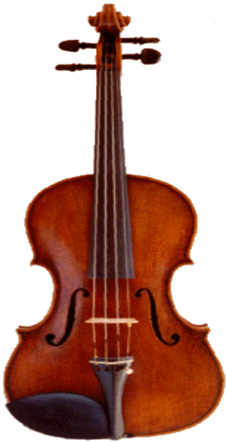
Figure 2. Douglas fir viola made in 1974 with copy of del Gesù's f - holes