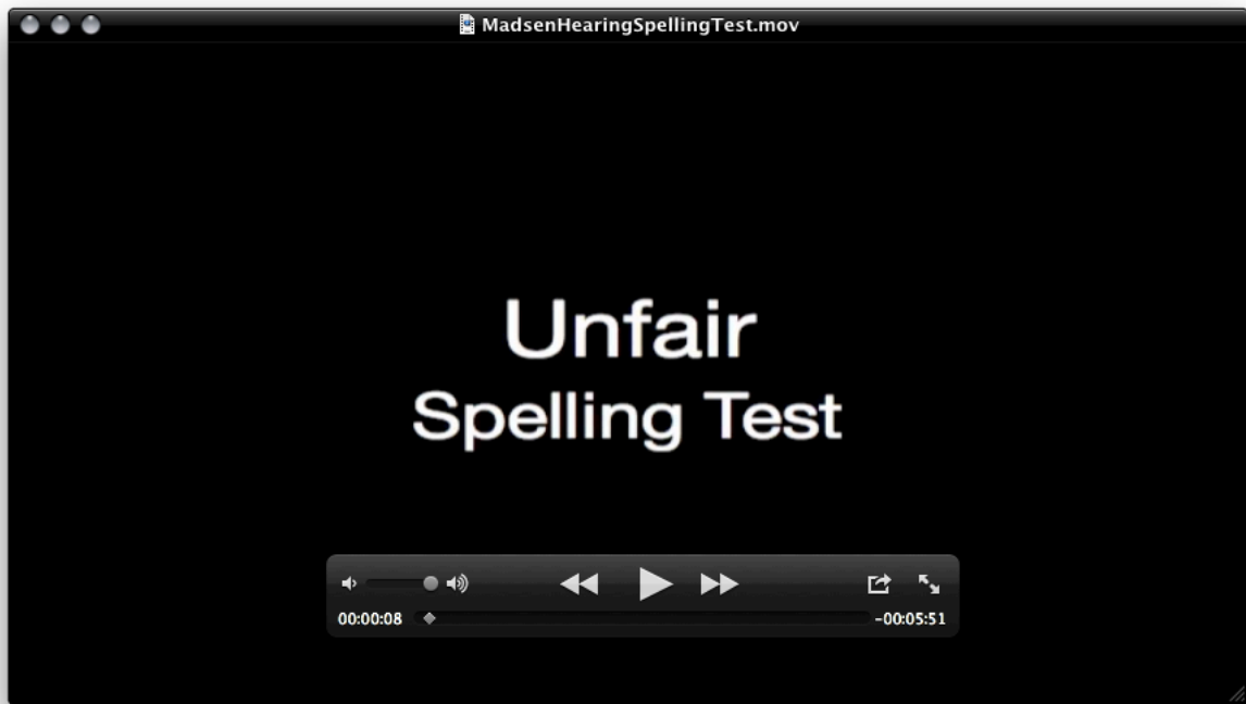
Figure 1 Screenshot of spelling test simulating hearing loss.