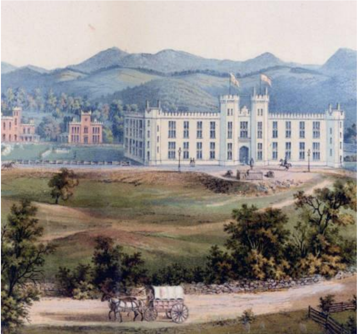
Figure 9. VMI in 1857