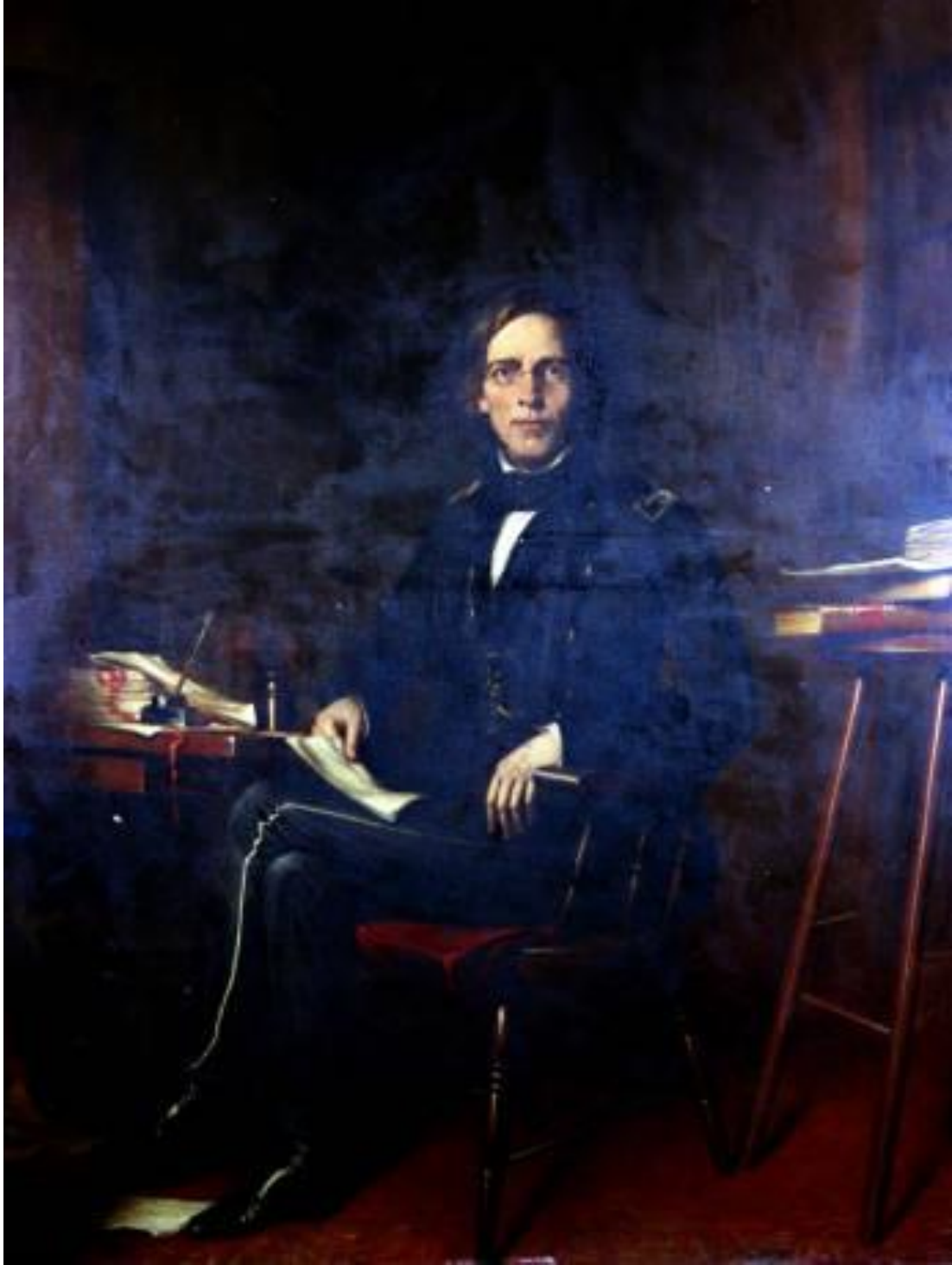
Figure 5. Francis H. Smith in 1853