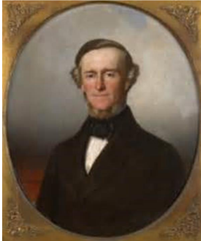
Figure 6. Philip St. George Cocke, 1850s

with agriculture and plantation operations and eventually writing a book, Plantation and Farm Instruction in 1852. 1