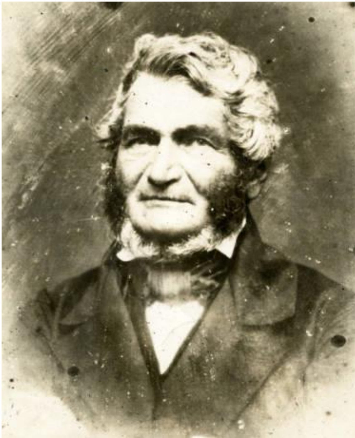
Figure 2. Crozet in 1855

expanded Board met in Lexington in May 1839 to start the process of organizing the school. Claudius Crozet was again appointed as the President of the new VMI Board of Visitors. 50