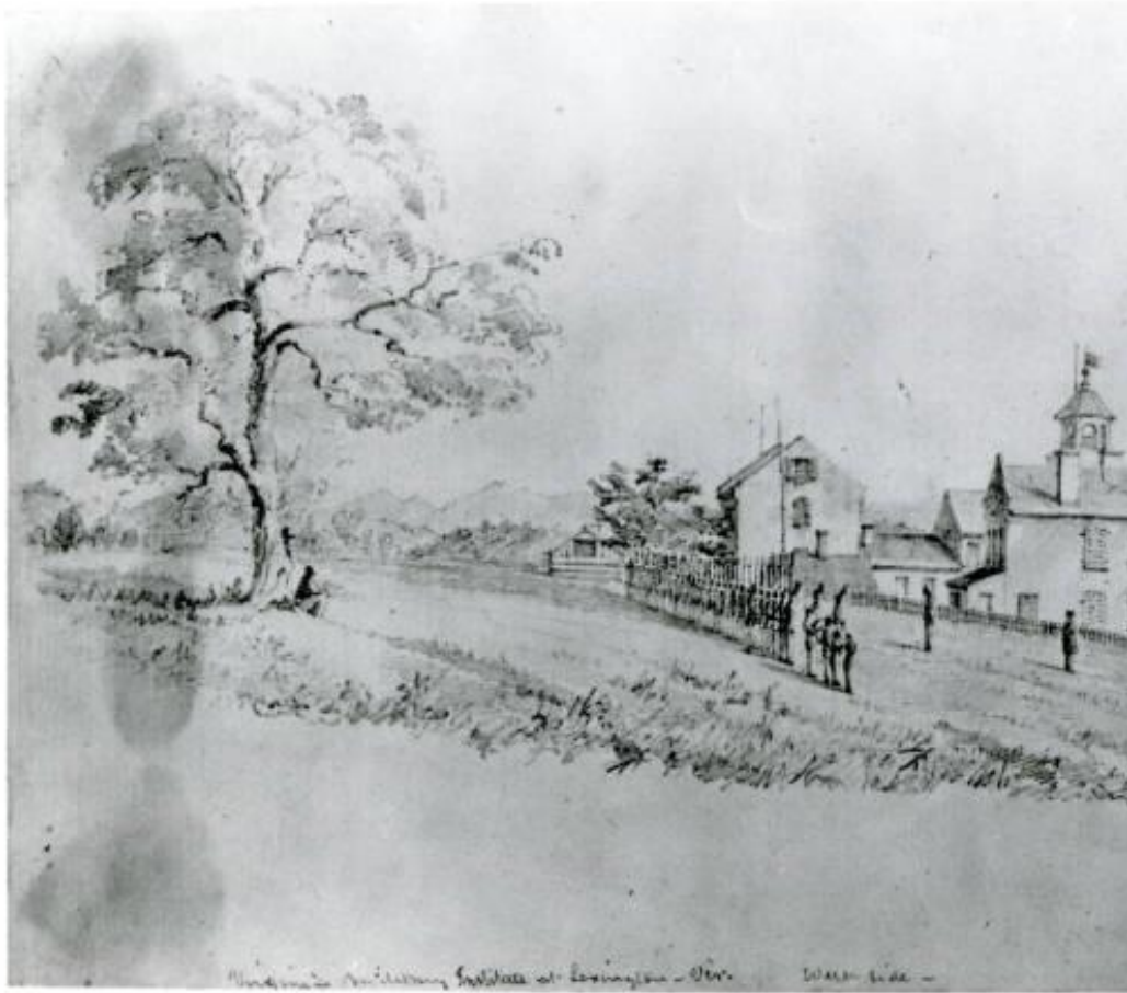
Figure 3. VMI Cadets Drilling next to Arsenal in the 1840s