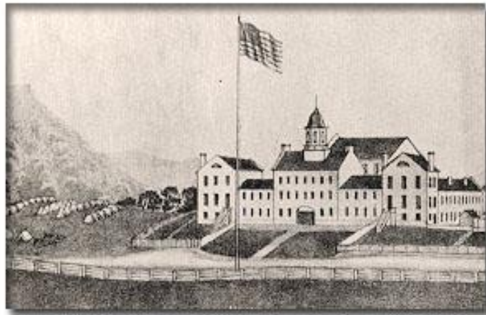
Figure 4. 1840s VMI showing original Arsenal Building

Cadets had no uniforms until the spring of 1840. They lived four or six to a room