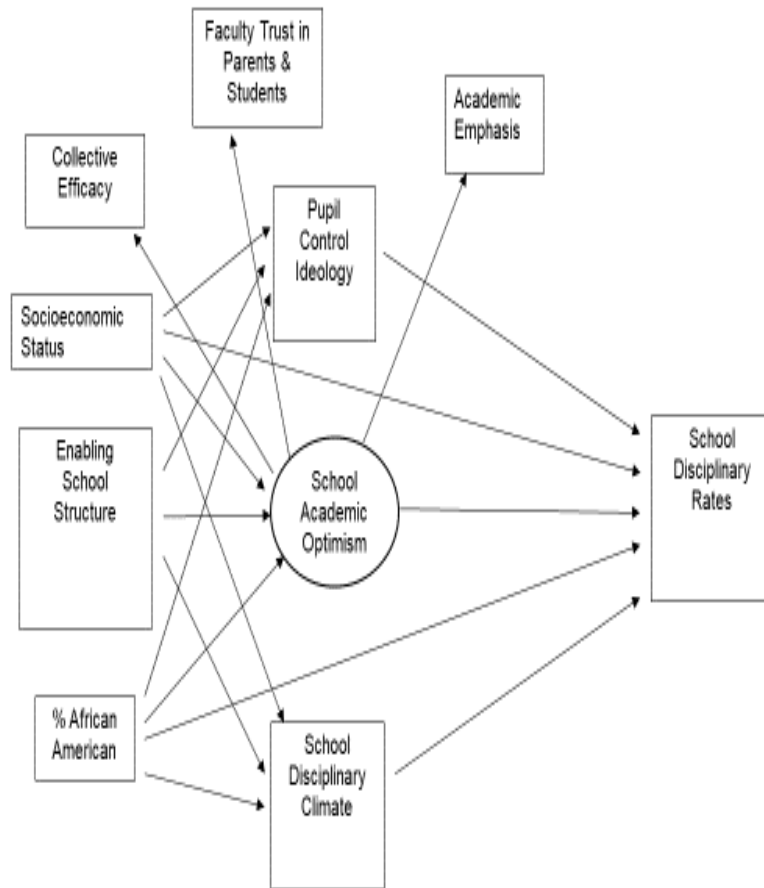
Figure 1. Hypothesized path model explaining school disciplinary rates

I tested four hypotheses in the empirical phase of this investigation. The four hypotheses were based on the literature review findings on academic optimism, pupil control ideology, and school disciplinary climate. The findings in the literature review led me to investigate the relationship between academic optimism, pupil control ideology, and school disciplinary climate, with school discipline rates.