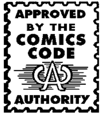
Figure 2.1. The Comics Code Seal.

In September of 1954, the Comics Magazine Association of America (CMAA) was formed in response to a widespread public concern over the gory and horrific content that was common in comic books of the time (“Horror,” 1954). This led to the Comics Code Authority (CCA) and regulations on content published in comic books. Comic book publishers that were members would submit their comics to the CCA, which would screen them for adherence to its Code. If the book was found to be in compliance, then they would authorize the use of their seal on the book’s cover (Hajdu, 2008). Pressure from the CCA and the use of its seal led to the censorship of comic books across the country.