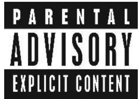
Figure 2.2. Parental Advisory Label. Courtesy of Recording Industry Association of America, Inc.

Yet another example of censorship in the United States would be the censorship of the music recording industry stemming from the use of Parental Advisory labels. The labels are placed on music and other audio recordings if the recording uses excessive profanities or inappropriate references. The intention of the labels is to alert parents of material that is potentially unsuitable for younger children (Cole, 2010).