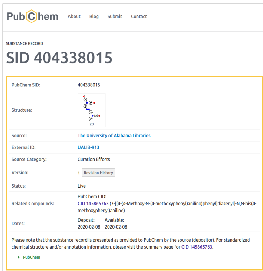
Figure 1. Example of a PubChem SID record with link to the UA Libraries

We also added the full bibliographic citation of each thesis in the Depositor Comment Field. We notified PubChem staff that our depositions contained linked synthetic preparatory procedures in the original thesis reference. As a result, PubChem created a workflow on their end during the standardization process, which created a “Synthesis Reference” annotation from the bibliographic reference in the Depositor Comment field. The thesis reference is then displayed on the associated CID record page in the “Synthesis Reference” Literature section (Figure 2).